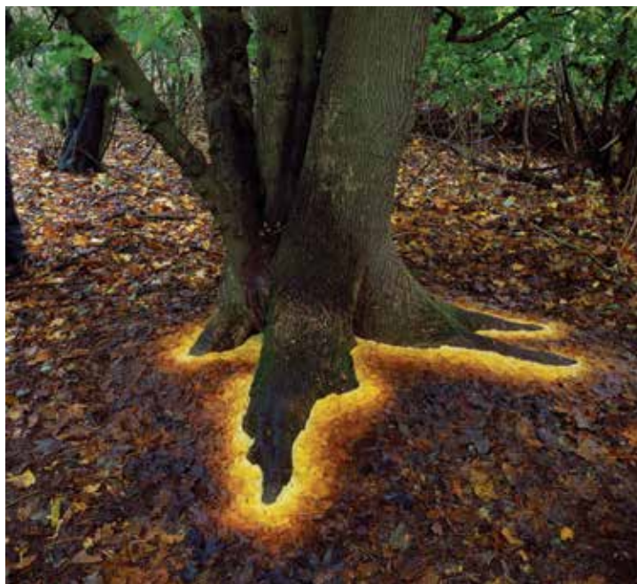
Andy Goldsworthy, Glowing Tree , 2013

In one of our most popular programmes, ākongā will explore our relationship with the natural world and learn more about how organic material can be used to create eco-friendly artworks. Using natural materials ākongā will create their own artwork inspired by nature. They will gain a deeper understanding and connection to Papatūānuku through exploring the work of artists who use natural materials in their practice. This is also an opportunity for ākongā discuss the complexity of the relationship between humans and their environment, as well as ways to ensure we take better care of the planet in the future.