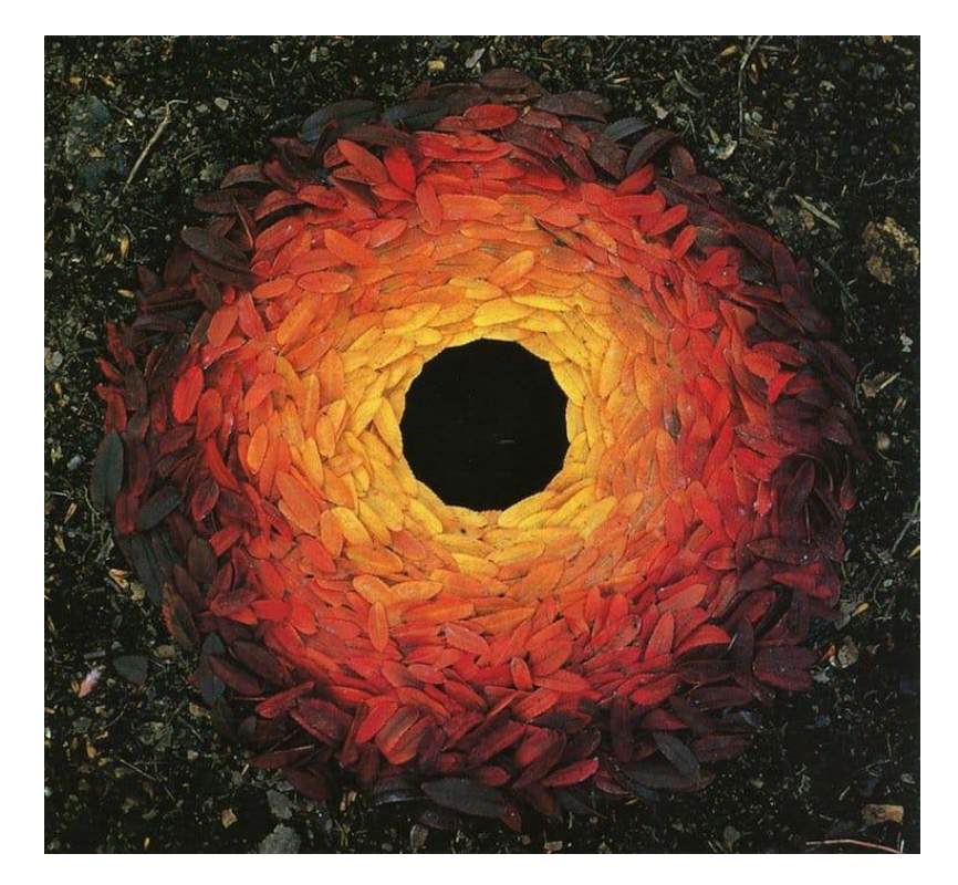
Andy Goldsworthy, Rowan Leaves Laid Around Hole, 1987

These images are of artworks by two different artists.